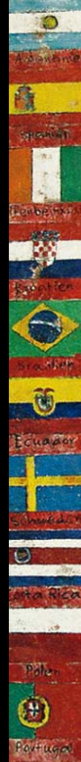
Coca-Cola Germany, on the occasion of the 2006 World Cup