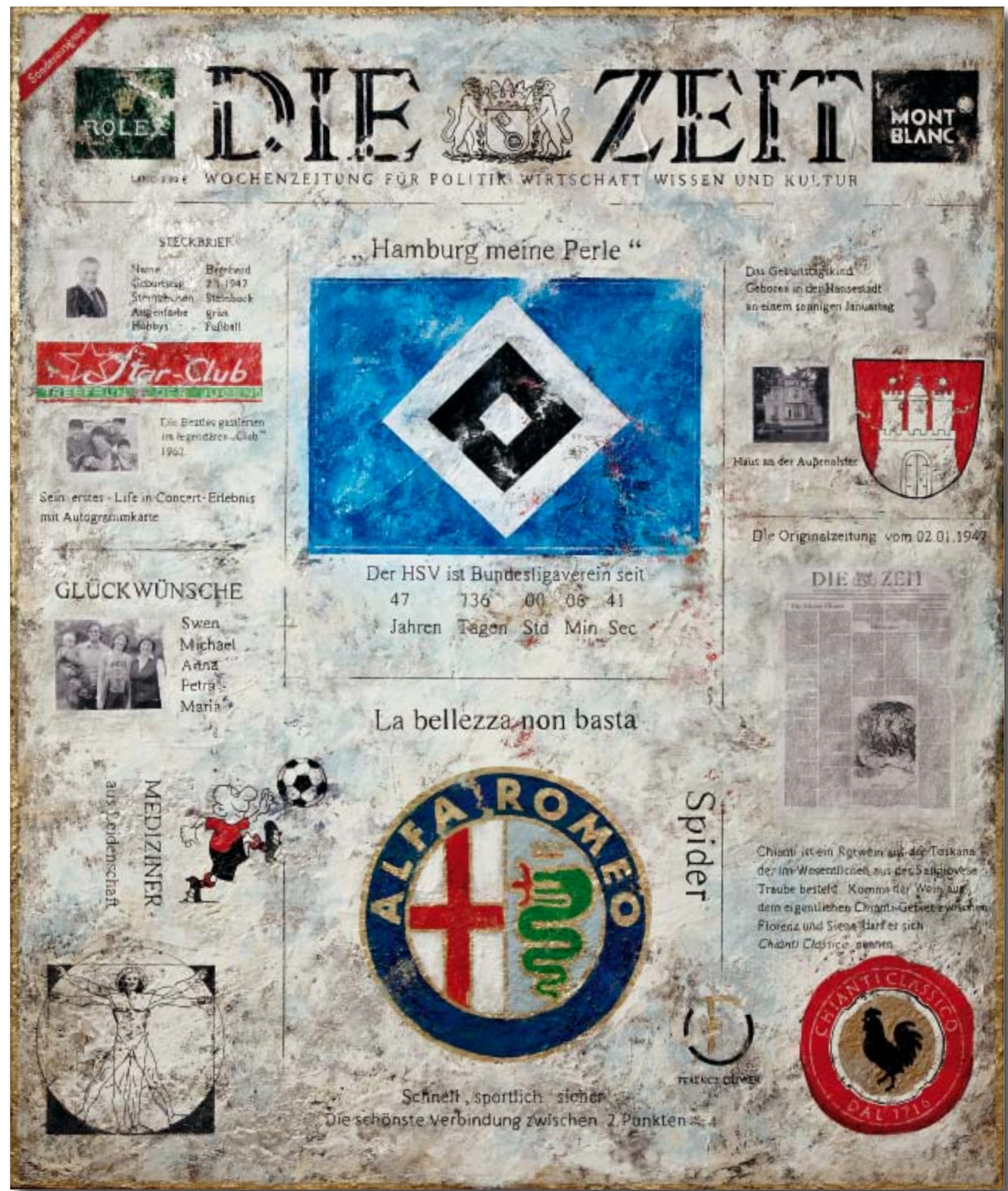
190 cm x 160 cm, Mixed media / collage on canvas

Example of the premium version: Here, paintings of the most important figurative marks, such as the favourite club, car make, coat of arms of the city of birth as well as hobbies are integrated and the title page of the original newspaper is incorporated for the person celebrating his/her jubilee