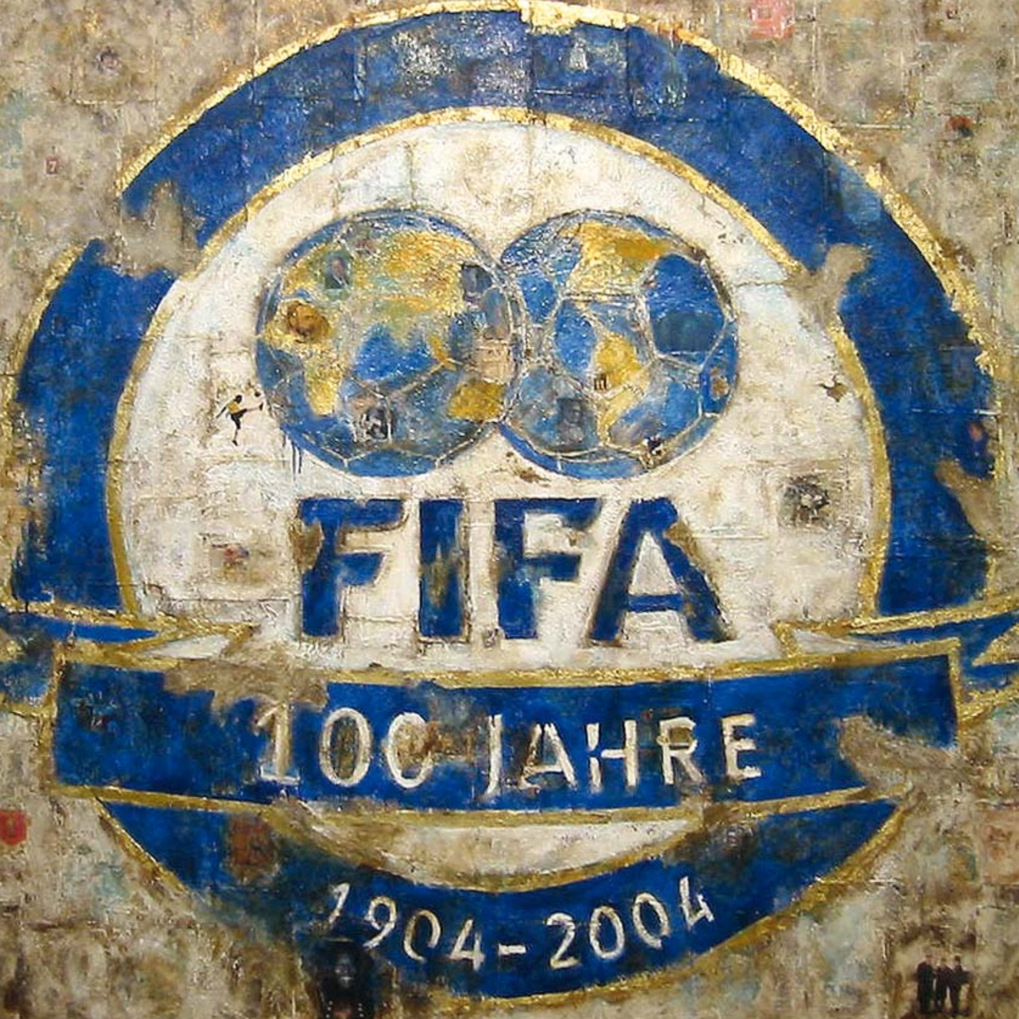
FIFA centenary, Zurich headquarters, Switzerland