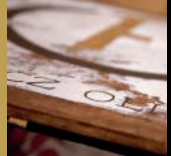
Artistical interpretation of the logo „Ferez Olivier“ on a treasure chest