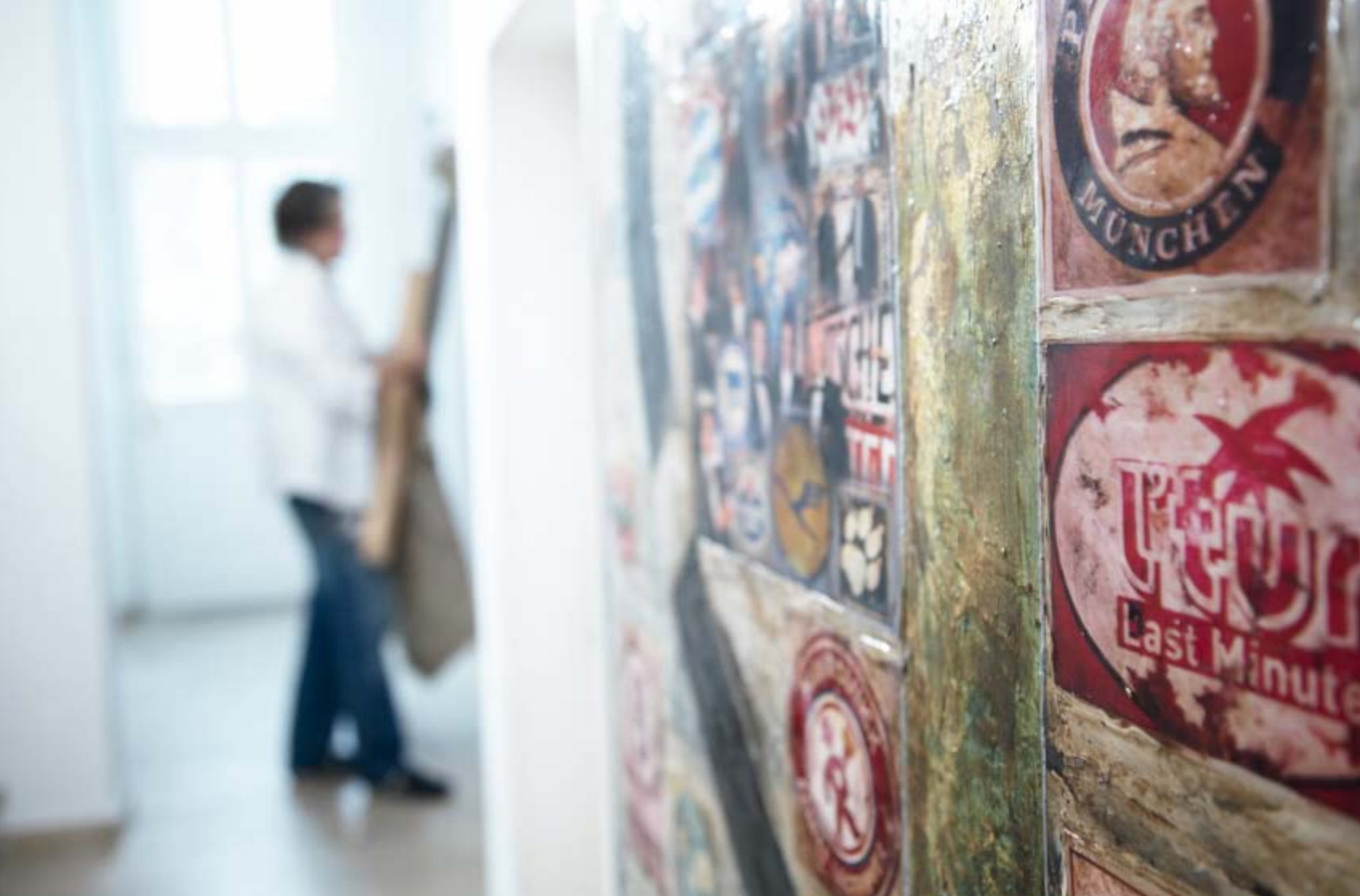
Impressions from the studio