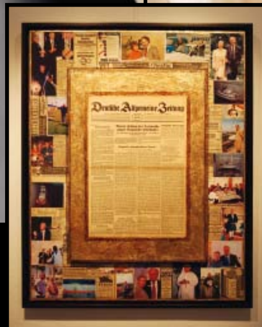
TimeArt example: Original newspaper in the centre, personal photos as well as incorporated slogans from the same newspaper