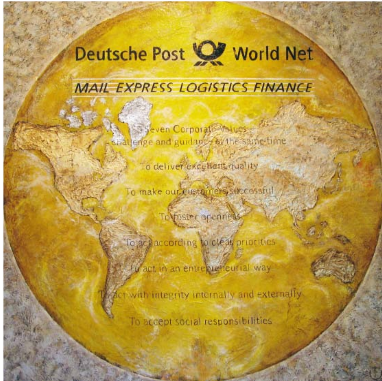
200 cm x 200 cm, Mixed media on canvas