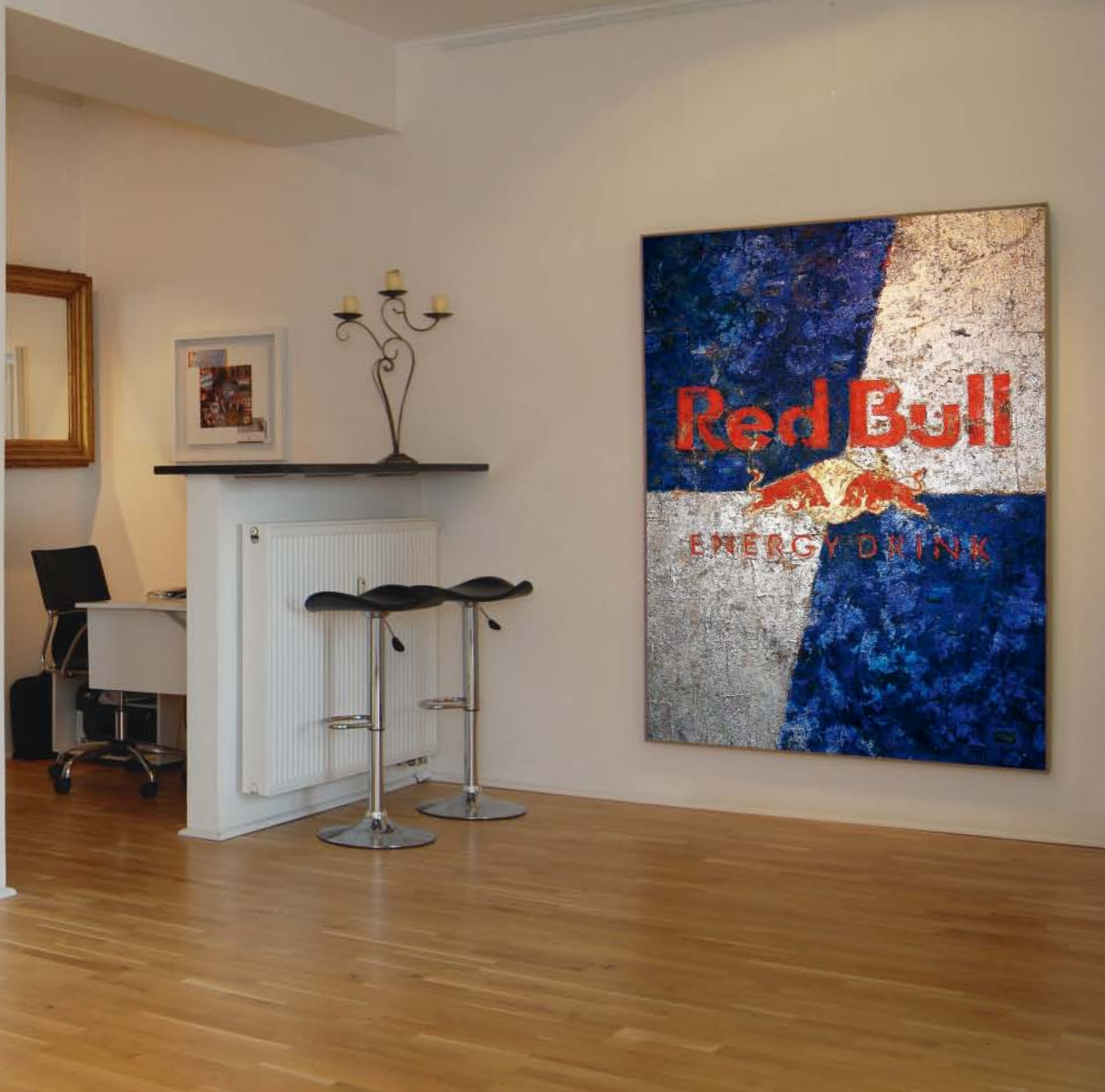
Jägermeister, 200 cm x 150 cm, Mast-Jägermeister AG, collection, Wolfenbüttel