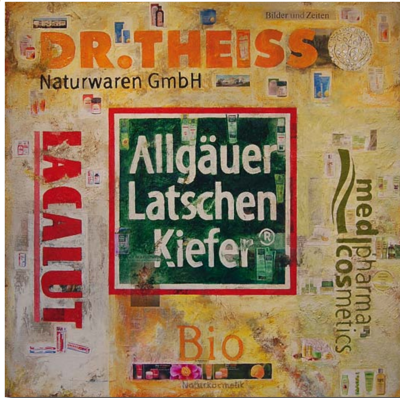
195 cm x 195 cm, Mixed media on canvas