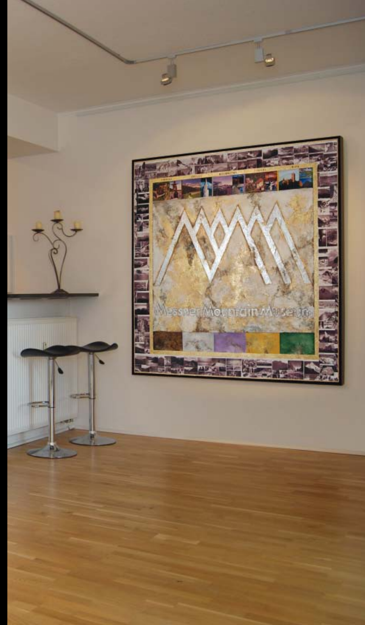
205 cm x 205 cm, Oil / collage on canvas