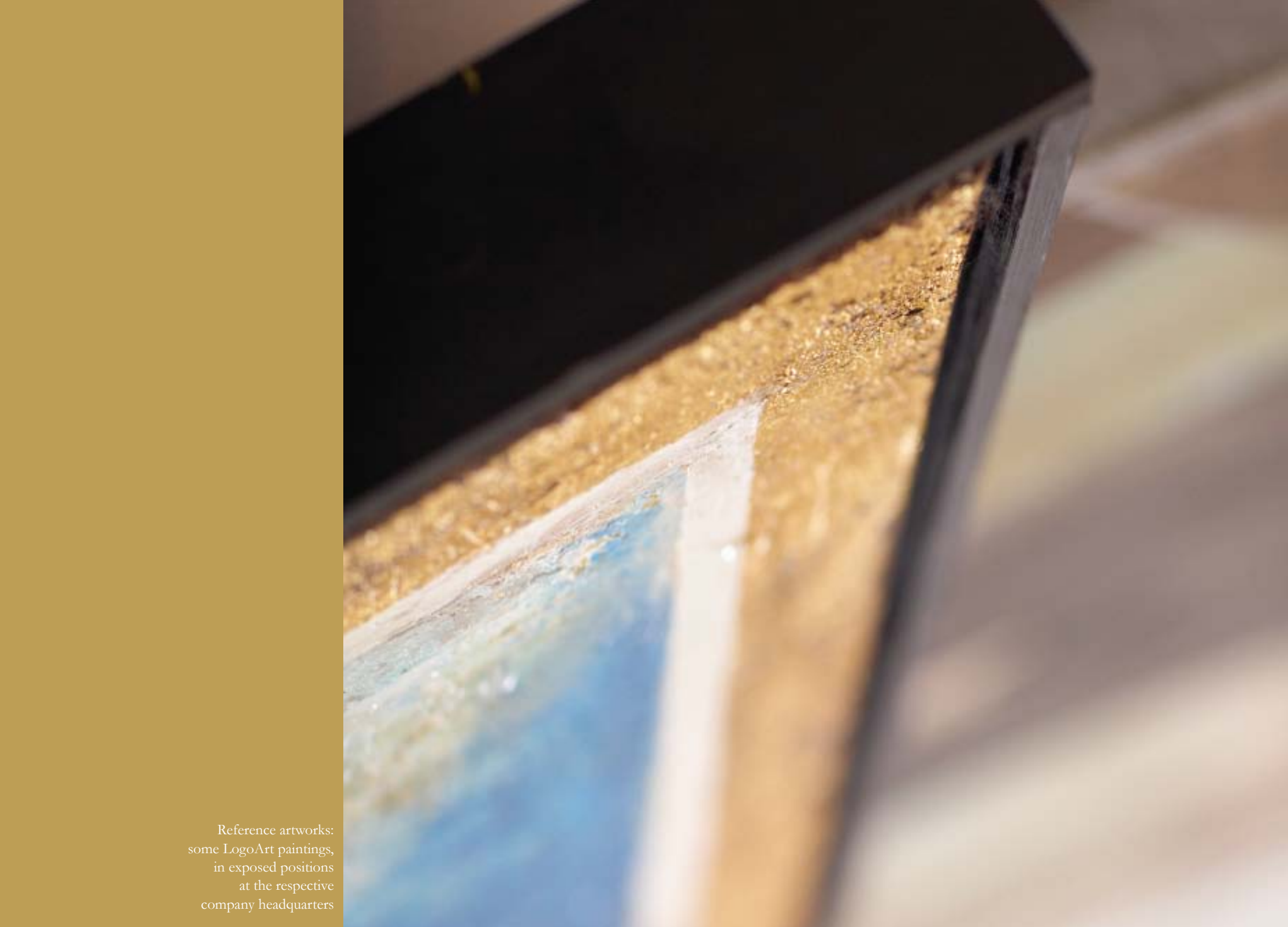
Reference artworks: some LogoArt paintings, in exposed positions at the respective company headquarters

A trademark logo communicates values and represents the company