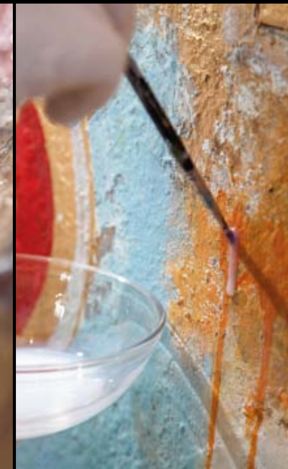
Detailed work using gold leaf and linseed oil