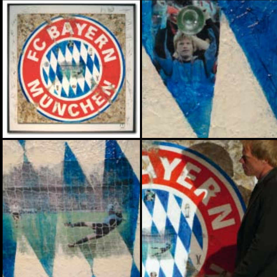
Departure of Oliver Kahn, September 2nd 2008, Allianz Arena, Munich, Germany