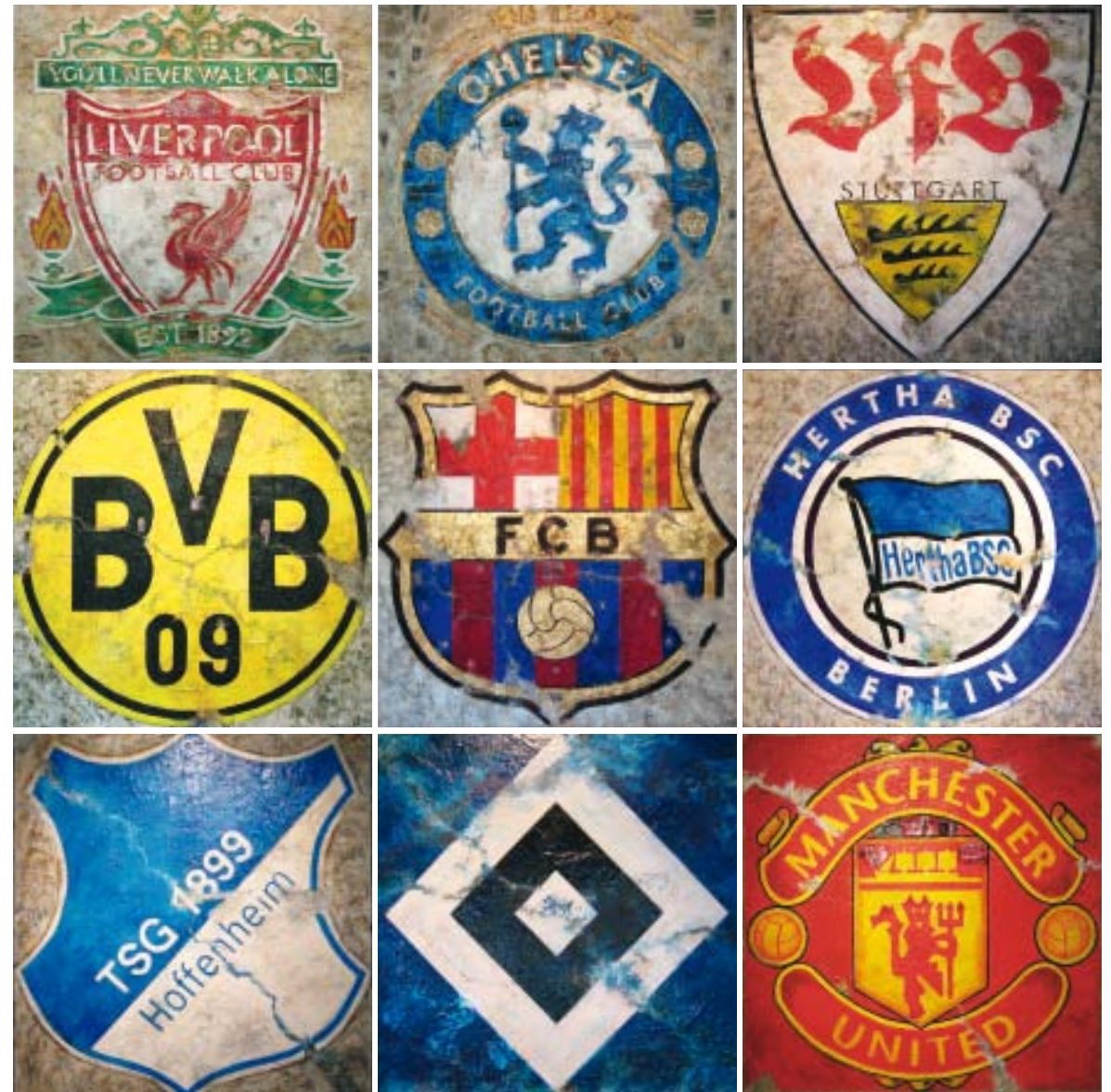
various football clubs