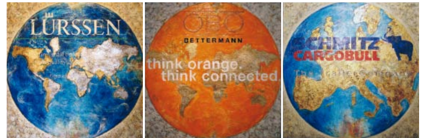
Artistic interpretation of trademarks using globes

The WorldArt artworks consistently continue the trademark art involving the globe as an element of design. The message is unmistakable. Companies selecting this type of presentation are operating Europe-wide or globally and wish to express this fact through art. Thus, artefacts are created that clearly underline the pride and the success of a company and convey this to the viewer through a unique work of art.