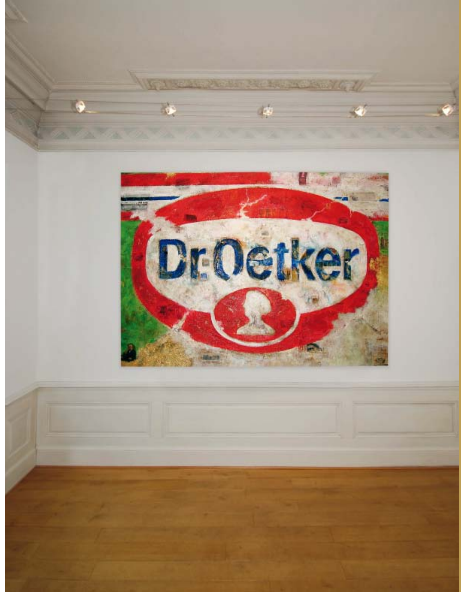
Dr. Oetker, 200 cm x 150 cm, Inauguration of the new building for the Oetker-Welt, Bielefeld, Germany