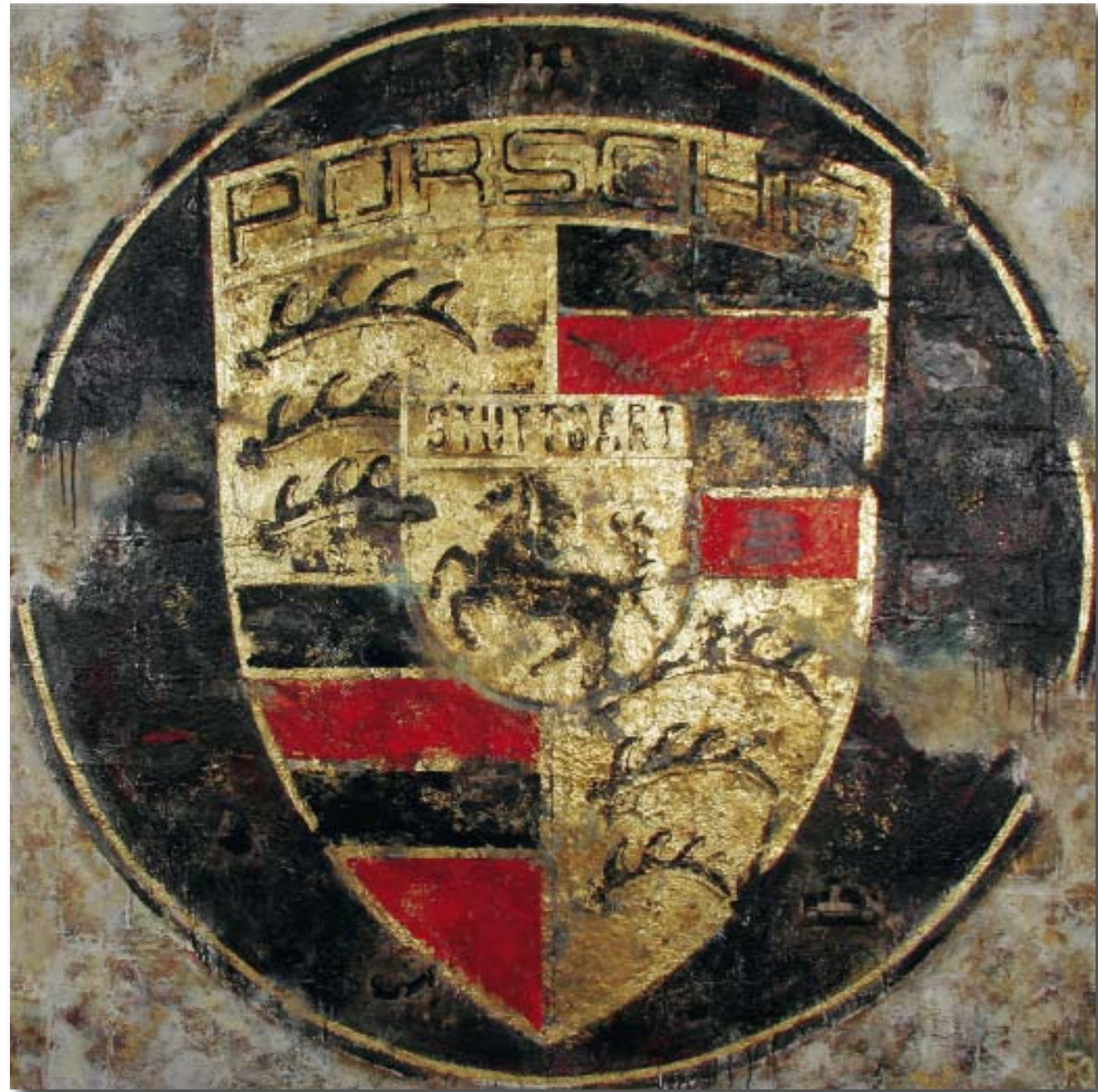
190 cm x 190 cm, Mixed media on canvas